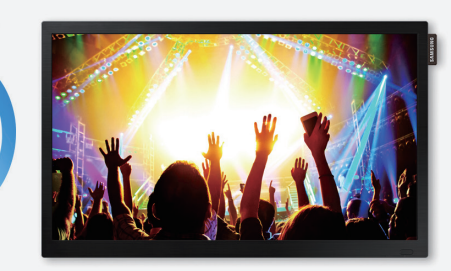
Figure 3. Users can manage and distribute content using mobile devices