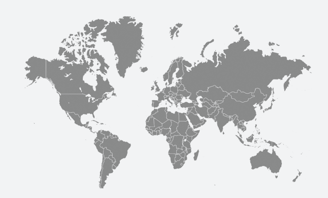
Figure 5. Global presence of Samsung

In addition, Samsung small-sized displays are backed by a 2 to 3-year warranty depending on the model.