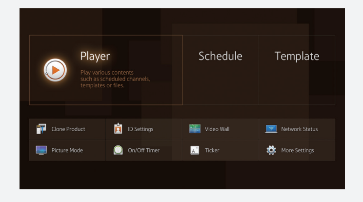
Figure 2. Samsung small-sized display dedicated Home UI design

The new touch-friendly Home UI delivers simplified, intuitive display operation for user convenience. Main functions are conveniently available on the Home screen, without having to go through multiple sub-menus, and represented with large menu buttons, for ease of use. A selection of menu configurations is also easily accessible on the Home screen.