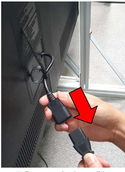
Power cord – Just pull it out

A Power cord plugged into the back of the display can easily be removed by hand or cables are provided as de-attached from the product