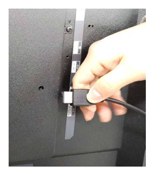
■ HDMI Cable – Just pull it out.