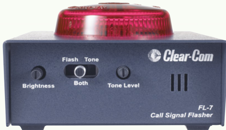
FL-7 Front view

The FL-7 Call Signal Flasher connects to any Clear-Com or compatible intercom system, providing both a visual and an audible indication of a call signal on the intercom channel. The flasher emits a bright amber strobe light twice a second in response to a call.